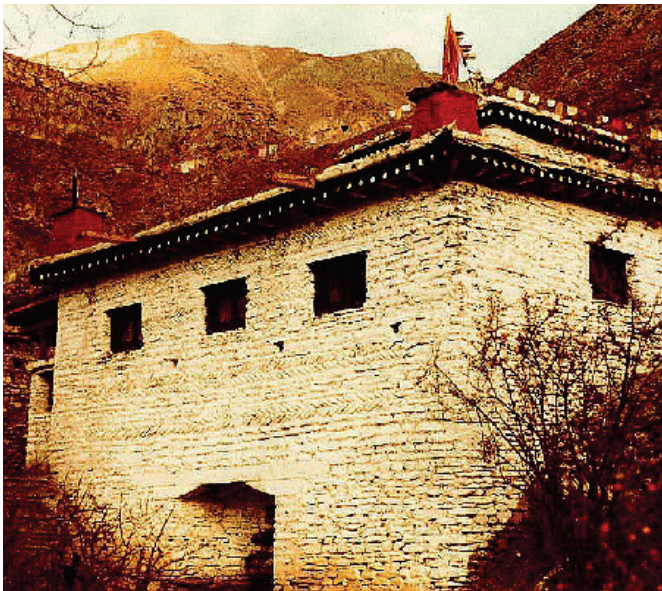
The "Temple Of Miraculous Fire" at Muktinath, Nepal. Photo by Ken Street (Nov. 1979).

[For more on this subject, please read our tract The Temple Of Miraculous Fire .]